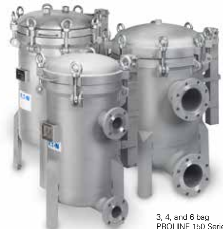
3, 4, and 6 bag PROLINE 150 Series HE multi-bag filter housings