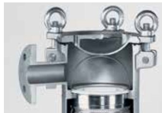
Compression bag hold down creates 360 degree sealing between filter bag and bag filter housing