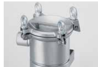
Ergonomic, integral cover handle is easy to open and close