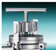
SIDELINE with T-bolt closure (TSBF)

Viton® is a registered trademark of E. I. du Pont de Nemours and company.